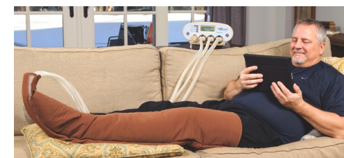
Figure 4. Patient is using a lymphedema pump at home to maintain a healthy and functional extremity once affected by extreme swelling.

There is no cure for lymphedema. However, there are many methods to help control the symptoms of lymphedema and to restore patients to a better quality of life. Treatment consists of aggressive swelling control and wound management during the treatment phase. Once all wounds have healed and the swelling is minimized, then patients will need to continue therapy for swelling control during the maintenance phase. Initially,