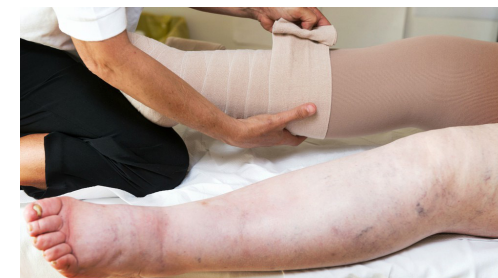
Figure 3. A patient with bilateral lymphedema is undergoing compressive therapy with stockings and bandage wrapping to help control swelling.