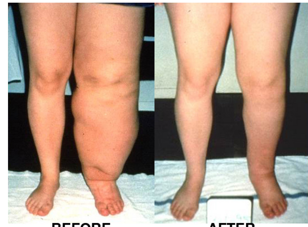
Figure 5. Before and after photographs of a patient suffering for years with left leg lymphedema. Utilizing multiple treatment modalities, the patient was able to restore her leg to a healthier and more functional state.

aggressive treatment modalities may include daily wrapping or medicated wrapping (Unna boot) with bandages of the affected limb in order to heal any wounds that may be present ( figure 3 ). Elevation and compression therapy will be recommended for treatment and maintenance of swelling control. Compression garments are typically of prescription strength (20-30 mmHg or higher). Some patients may prefer physical therapy or lymphedema massage techniques that can be done either at a lymphedema clinic or at home. Most patients will end up needing pneumatic compression devices, or lymphedema pumps, to assist with long term maintenance of leg swelling ( figure 4 ). These pumps are fitted for each patient and are provided for home use. Ultimately, patients will be able to use the pumps for 30-45 minutes a day to minimize the lymph fluid in the legs and then wear compression stockings as they go about their day. These pumps help to minimize